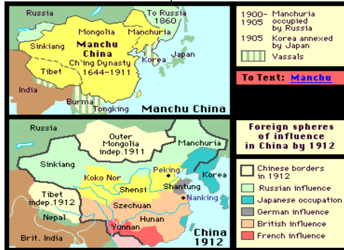
Figure 1, Spheres of Influence

Although the Boxer Rebellion proved to be a failure, just like so many rebellions before it, the people learned something drastic. They discovered that they could not rely on the Qing rulers to look out for the interests of the people. Detailing the reasons for this, the authors of The Search for Modern China write, “Initially, Qing troops suppressed the Boxers, but in January 1900 the dynasty ordered that the Boxers should not be considered bandits” (Cheng et al, 185). This failure to support the people initially resulted in the Chinese having lost what little faith remained in the Qing. Worse yet was that the children were indoctrinated